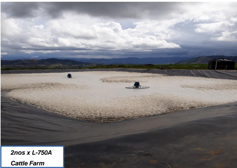
2nos x L-750A Cattle Farm