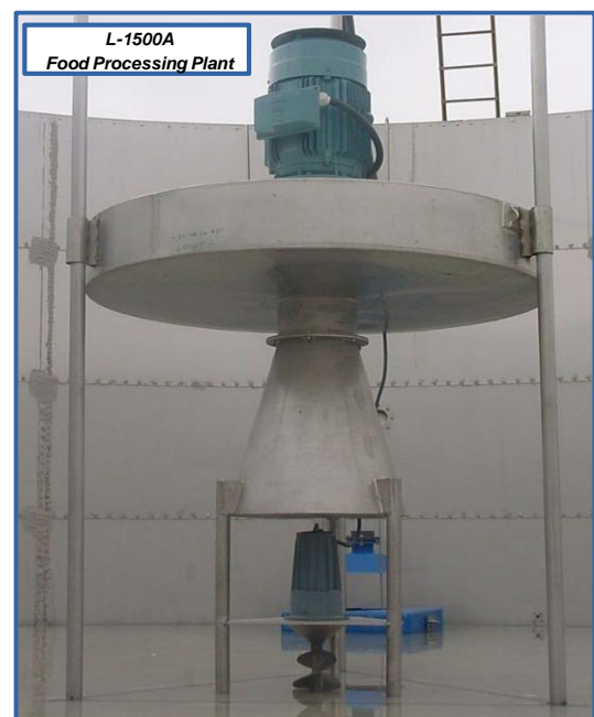
L-1500A Food Processing Plant

Surface aerator is manufactured for its reliability and durability for extreme conditions operation. It can be installed in small tanks or massive lagoons. Draining of the tanks or lagoons is not required during any installation.