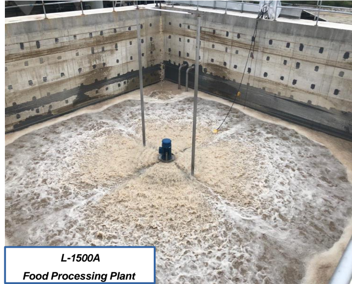
L-1500A Food Processing Plant