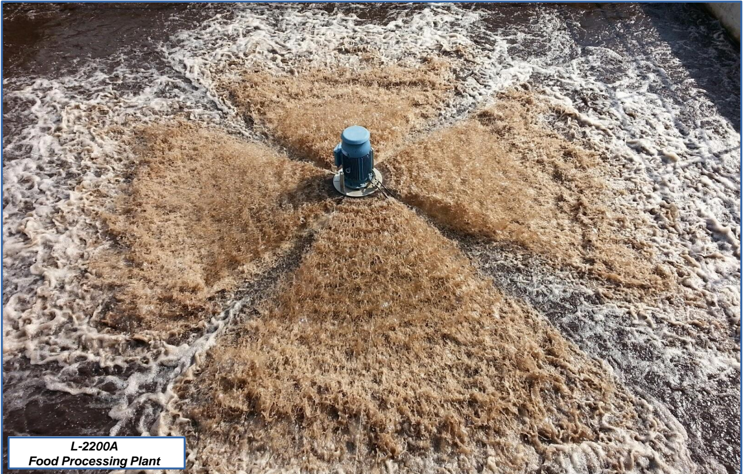
L-2200A Food Processing Plant